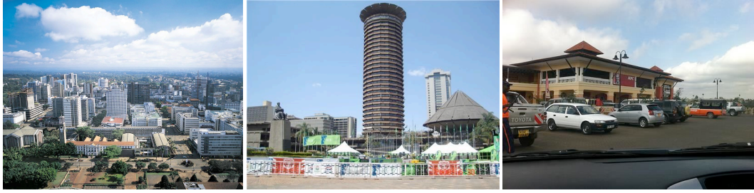
Itinerary for Great East African Migration